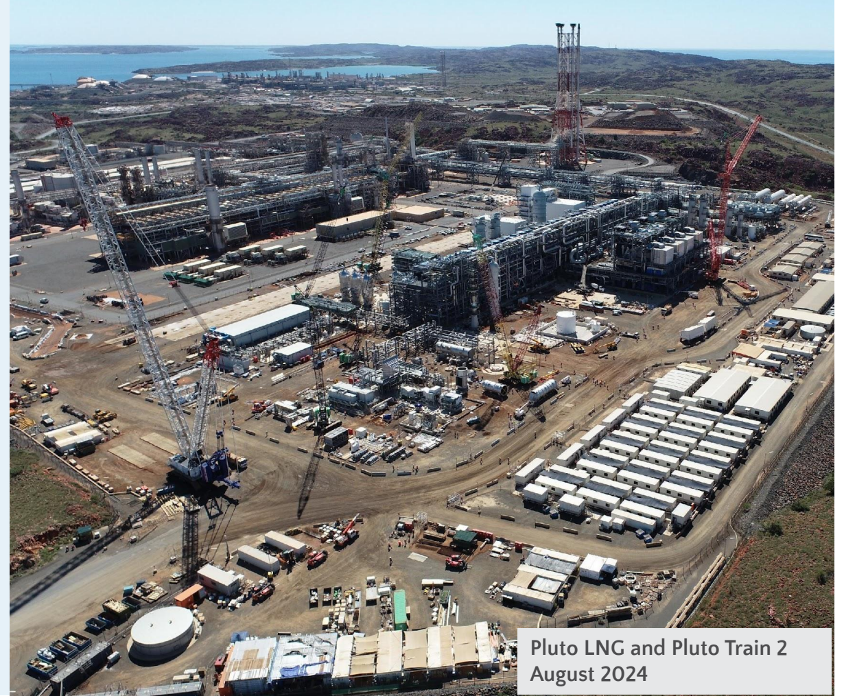
Pluto LNG and Pluto Train 2 August 2024