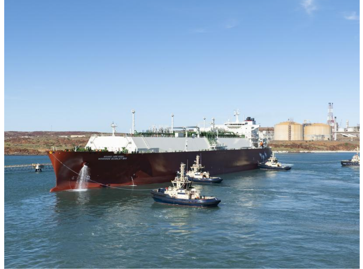
Scarlet Ibis arrives in Karratha, Australia 12 July 2024