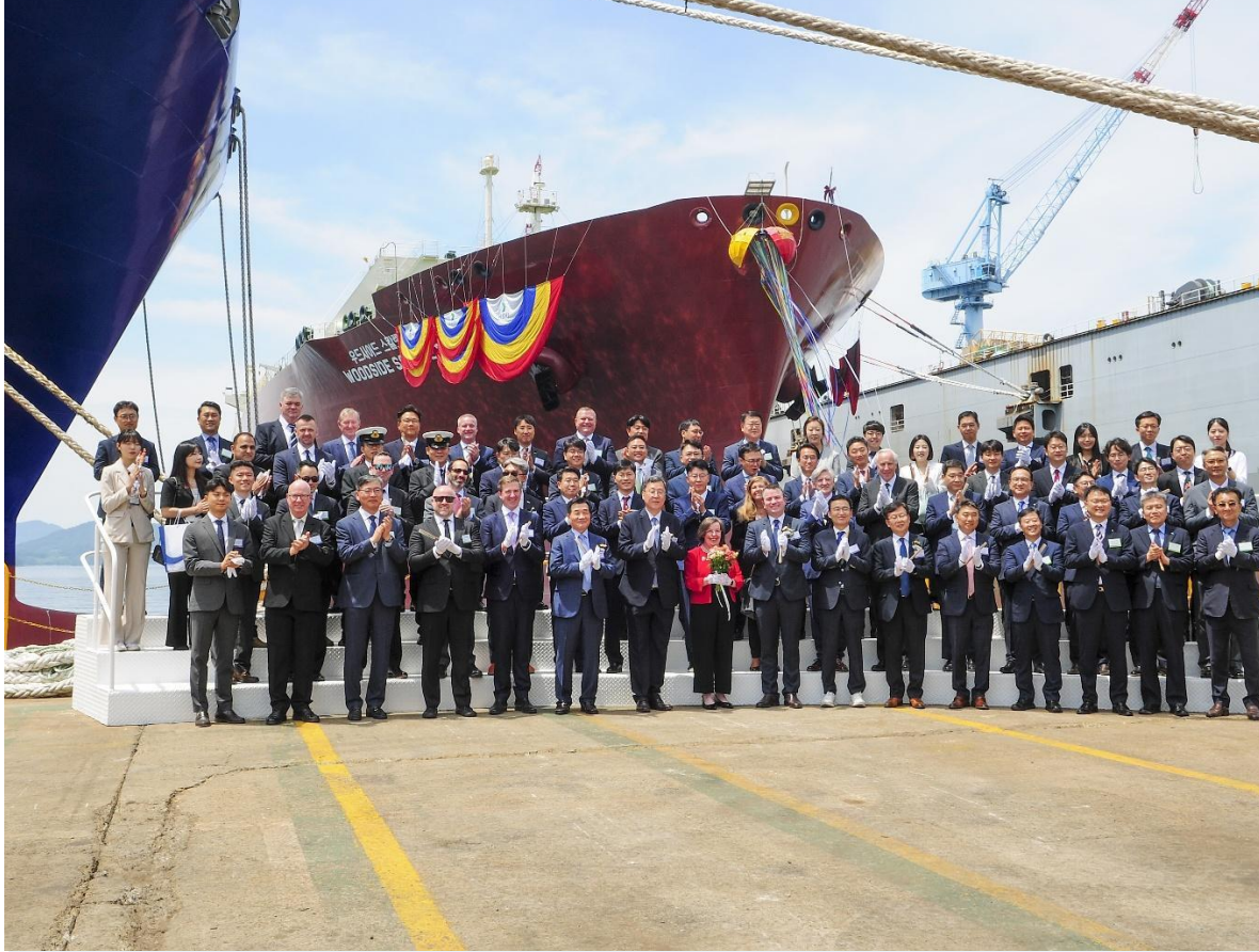
Scarlet Ibis naming ceremony, Mokpo, Korea 19 June 2024